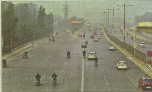
■ The road rationing scheme had managed to reduce traffic on some of Delhi's busiest stretches in the first phase.

Hindustan Times had compared the data provided by DPCC